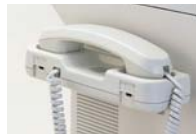
Handset Kit UE-403171

Memory SD Memory Card (Maximum 512MB) *Contact your local dealer